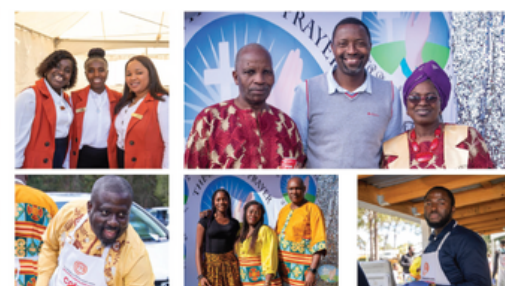
15th Our Year of The Holy Spirit & POWER!