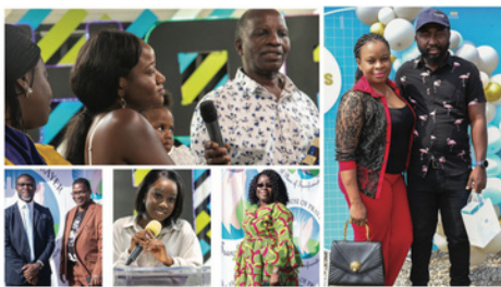
Our Year of The Holy Spirit & POWER!