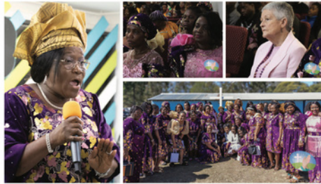
Our Year of The Holy Spirit & POWER!