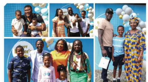
Our Year of The Holy Spirit & POWER!